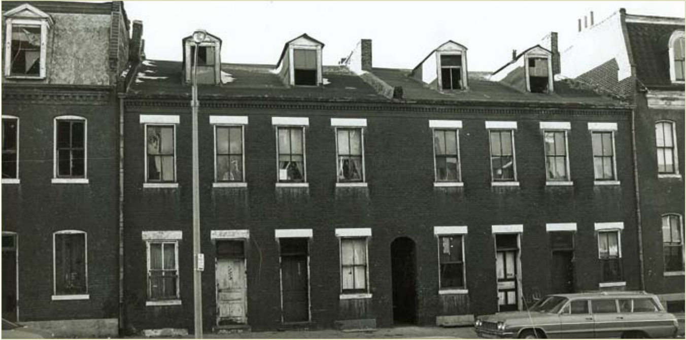
The Soulard area of St. Louis, 1972 [SHSMO #018165]