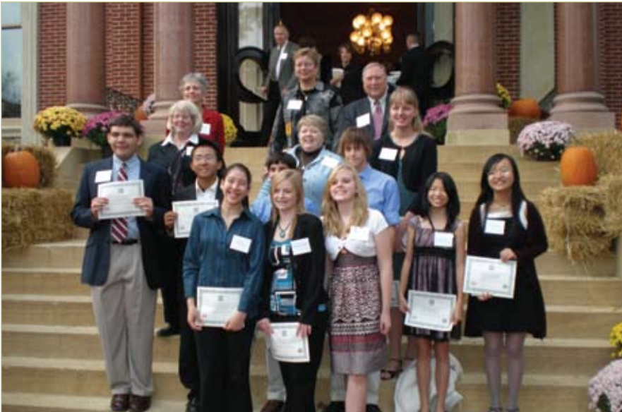
National History Day finalists, award certificates in hand, and their teachers pose on the steps of the Governor's Mansion.