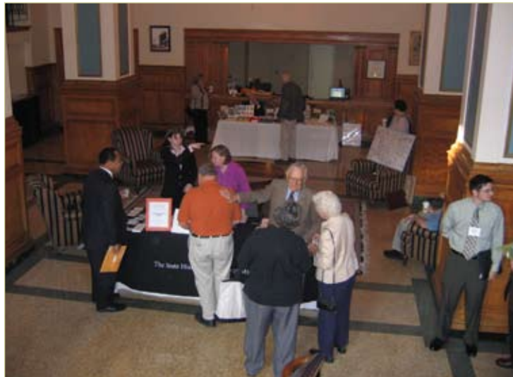
Guests sparked conversations with acquaintances old and new as they arrived at the Tiger Hotel for the annual meeting.