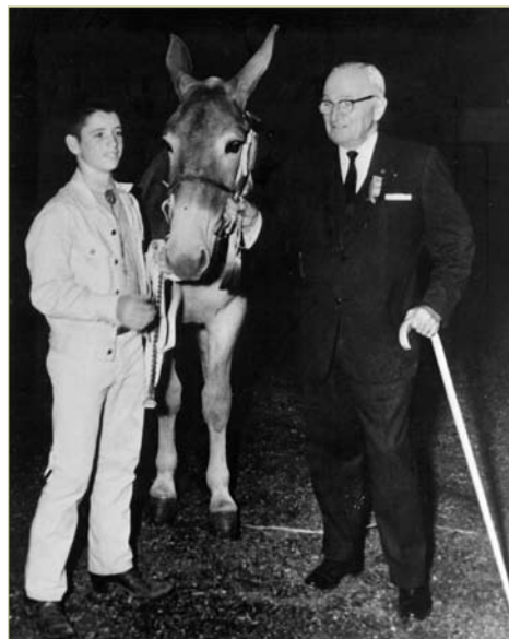
Scenes from the American Royal (top to bottom): A horse parade, 1924; a young man taking part in the boys and girls 4-H Club Calf Group, 1924; and former President Harry S. Truman greeting a mule and its exhibitor, 1963.