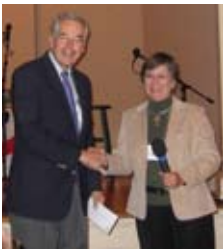
Annual Meeting awards Page 3

The State Historical Society of Missouri and Western Historical Manuscript Collection