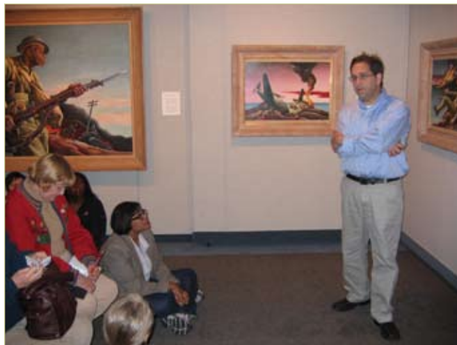
Thomas Hart Benton scholar discusses the Year of Peril paintings during his talk at the Society on October 17.