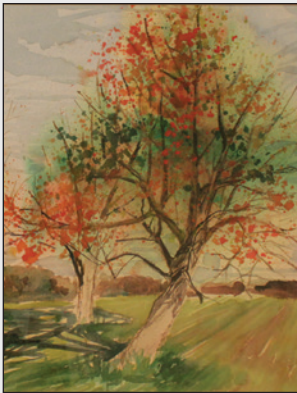
Special Exhibition Page 3