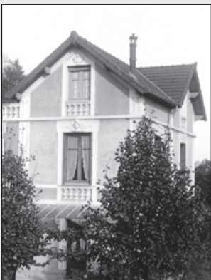
WWII Safe House Page 11