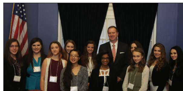
Missouri state treasurer Eric Schmitt visits with National History Day in Missouri students during the annual Day at the Capitol.