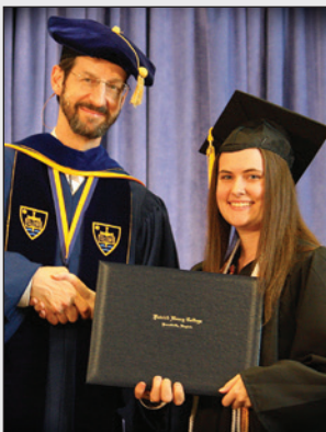
NHDMO Alum Page 4